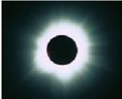
Solar Eclipse August 1, 2008