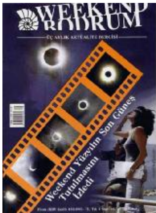
Weekend Bodrum did a write up on our Total Solar Eclipse Sailing in 1999.